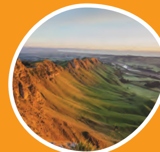
TE MATA PEAK + TUKITUKI VALLEY