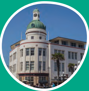
SPOT THE ART DECO BUILDINGS