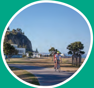
CYCLE ALONG NAPIER'S PATHWAYS