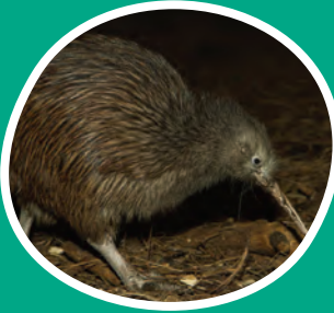
SEE REAL LIFE KIWI