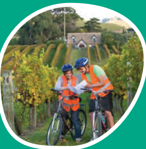
HIRE A BIKE AND DO A WINE TOUR