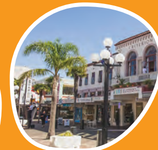
ART DECO CITY CENTRE