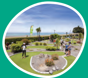
PLAY GOLF NEXT TO THE OCEAN