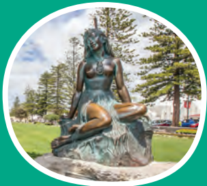
VISIT PANIA OF THE REEF