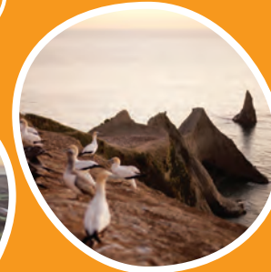
THE GANNET COLONY AT CAPE KIDNAPPERS