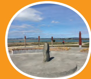
CELESTIAL STAR COMPASS